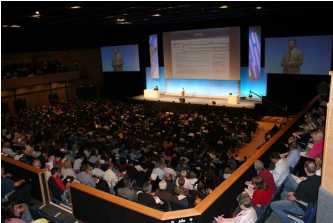
Me Speaking in Front of 4,000 People In England